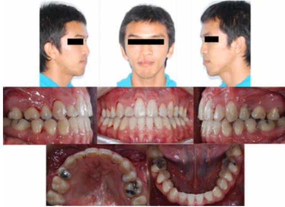
Fig. 5 Facial appearance and occlusion after orthodontic appliance removal