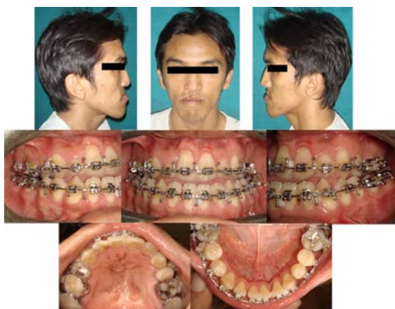
Fig. 3 Facial appearance and occlusion at predistraction orthodontic treatment