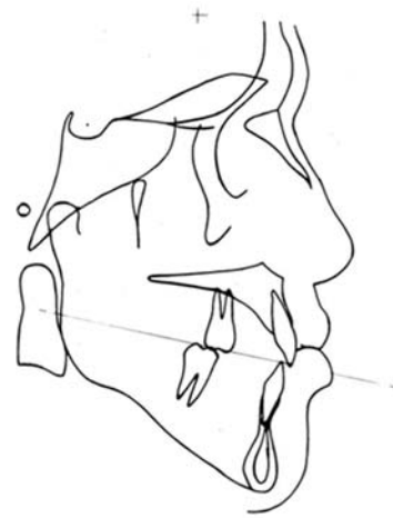
Fig. 6 Posttreatment lateral cephalogram demonstrates normal antero-posterior skeletal relationship