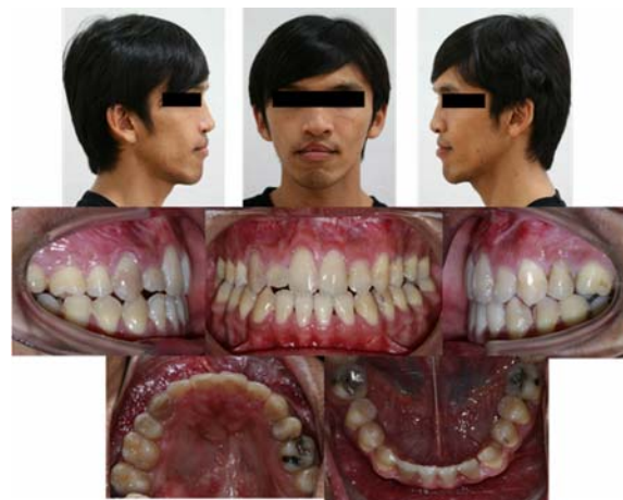
Fig. 8 Retention period photographs, at 20 months after orthodontic appliance removal

the latter being associated with backward rotation of the mandible. The facial concavity was significantly improved (facial profile from 186° to 175°) (Table 1, Fig. 6). Acceptable upper lip position was achieved (U-lip to E-line from -6 mm to -2.5 mm). Cephalometric superimposition (Fig. 7) demonstrated maxillary and mandibular changes from the pretreatment to posttreatment and retention stages. The maxilla moved forward and downward. The prognathism of mandible was reduced. The patient was reviewed on the 3 rd , 9 th , 15 th and 20 th months of the retention period. No relapse was found both clinically and cephalometrically (Fig. 5, 8, 7 and Table 1).