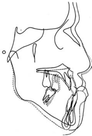
Fig. 7 Cephalometric superimposition, maxillary and mandibular movement and direction were compared, no skeletal relapse is observed - pre-treatment ( dark solid line ) - post-treatment ( dotted line ) - 20 th month retention phase ( light solid line )