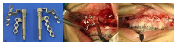
Fig. 4 A: Internal distraction devices, Synthes®, B: Device placed between zygomatic buttress and maxillary alveolar bone base, C: The final position of distraction ports that penetrates the mucosa at the buccal vestibule

similar to a Le Fort I osteotomy. Circumvestibular incision and complete osteotomy were performed and the maxilla was then down-fractured. Two intraoral distractors, Synthes ® (Fig. 4A), were fixed in the desired orientation at the zygomatic buttresses and alveolar bone bases (Fig. 4B). The distraction vector was oblique to the occlusal plane to move the maxilla anteriorly and inferiorly. The devices were activated to test their function and the mobility of the released bone segment and then returned to the starting positions. The surgical wound was closed with the two activation ports exited through the mucosa into the buccal vestibules (Fig. 4C).