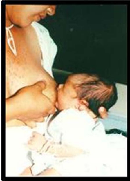
Fig. 1 The newborn's head should be upright in a sitting position. A small pillow is usually needed to support the mother's arm