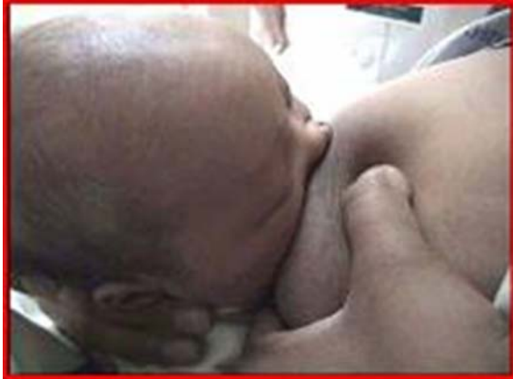
Fig. 3 The mother then pushes the other hand that supports the newborn's head and neck closely to her breast, using part of the mother's breast to seal any gap due to the newborn's abnormal lip and palate anatomy.