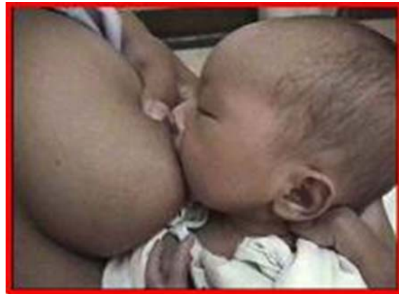
Fig. 4 The mother then pushes the other hand that supports the newborn's head and neck closely to her breast, using part of the mother's breast to seal any gap due to the newborn's abnormal lip and palate anatomy.

5. The LATCH score was used to evaluate the newborn's suckling. The newborn was weighted daily. Urinations and bowel movements were recorded. The duration and interval of breastfeeding were noted.