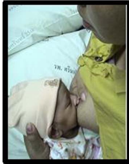
Fig. 2 The newborn's head should be upright in a sitting position. A small pillow is usually needed to support the mother's arm